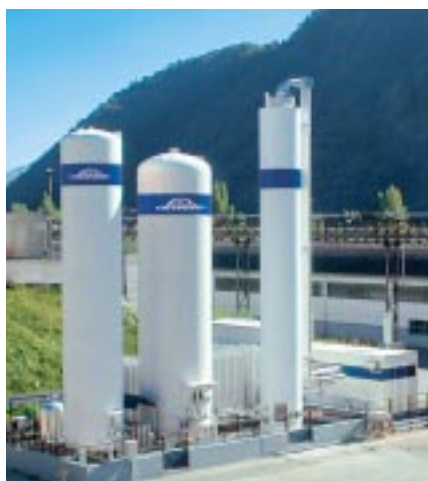
ECOVAR® system based on a CRYOSS® plant

carbon dioxide, most hydrocarbons etc.) are removed. One of the two adsorbers is always in operation while the other is being regenerated by residual gas from the separation process. The process air is cooled down to almost liquefaction temperature in the main heat exchanger in counter-flow with the cold separation products and then fed into the bottom of the rectification column. There, the feed air is rectified. The pure nitrogen fraction is withdrawn at the top of the column, heated up in counter-flow in the main heat exchanger and then fed into the product line. Cold is supplied in the form of liquid nitrogen (LIN) from the back-up system or is generated with an expansion turbine.